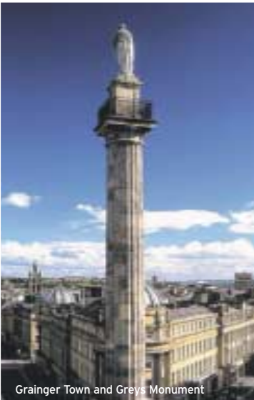
Grainger Town and Greys Monument