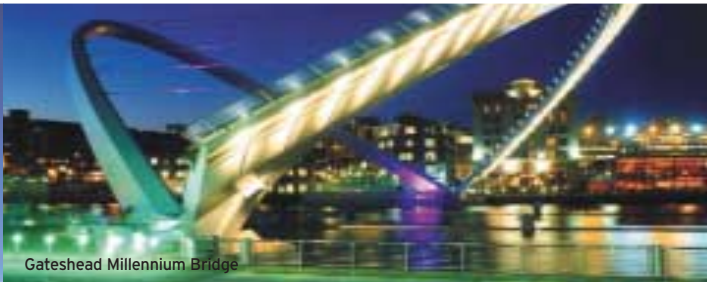
Gateshead Millennium Bridge