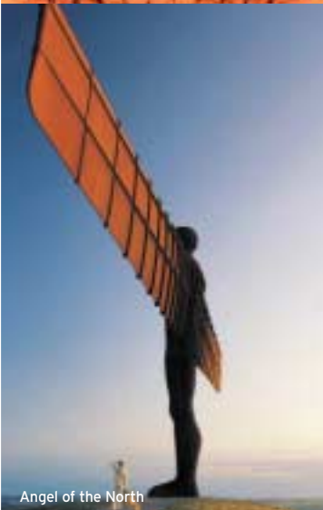
Angel of the North