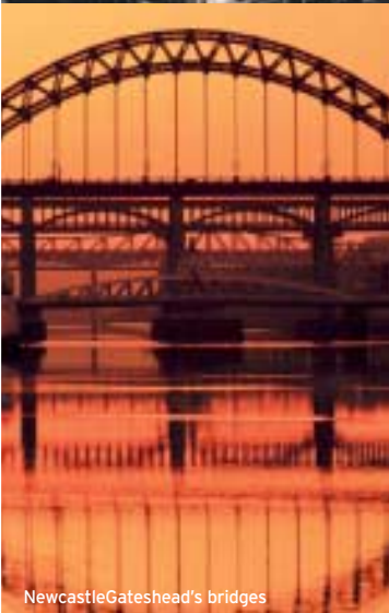
Newcastle Gateshead's bridges